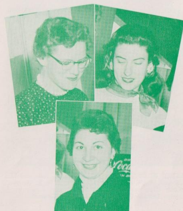
Venture Club of El Centro