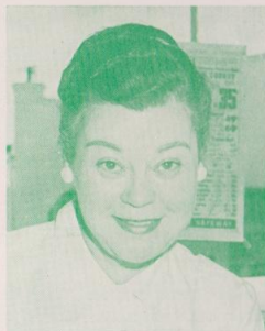
Sr. Women's Ten Thousand Club of El Centro